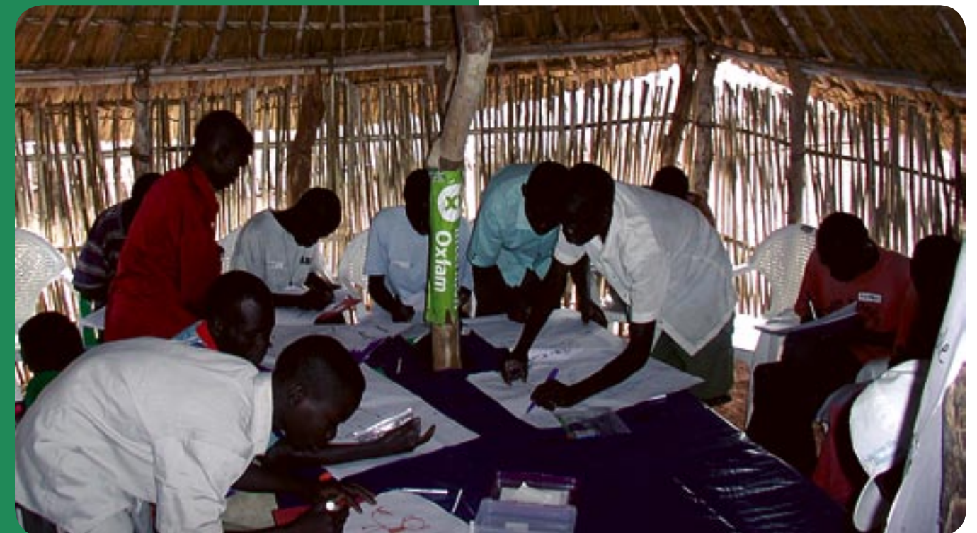
Students work on literacy exercises.

The people of Sudan want war to end. They do not want the petroleum. They want peace for their children. They want to grow crops for their families. They want to educate the people. They want to build the nation with schools, roads and bridges.